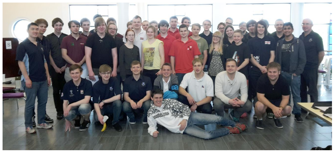
All junior teams and their captains gathered together at playing area.

(You can find this article and all results of the tournament at our web site <a href="www.bridgefinland.com">www.bridgefinland.com</a>.)